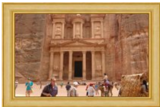
THE TREASURY AT PETRA