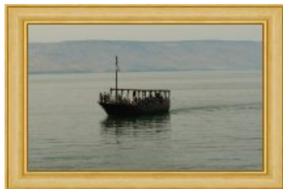
THE LAKE OF GALLILEE