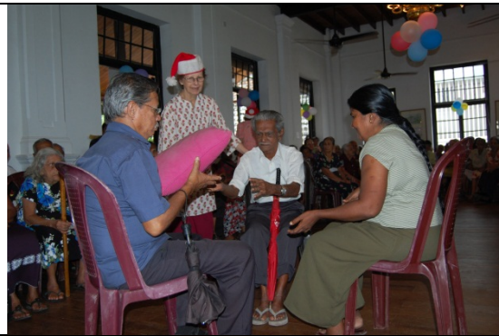
The finals of the "Pass The Pillow" Competition