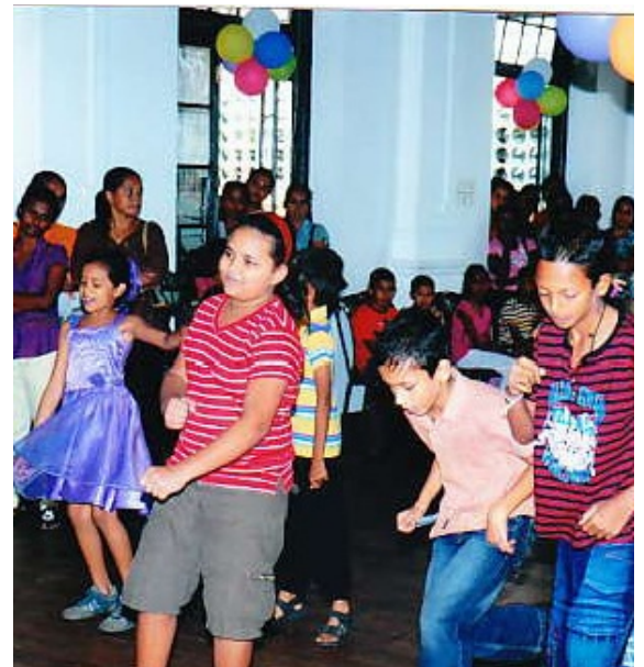
Dancing in Progress