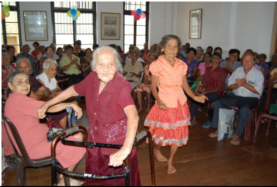
The dancing begins, the two oldest ladies take the floor