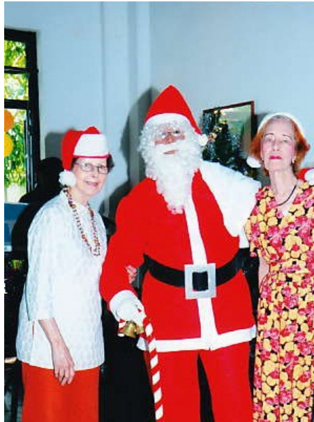
St. Nik and Helpers