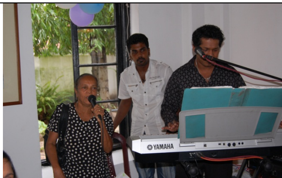
Some of the beneficiaries joined the organist in the carols