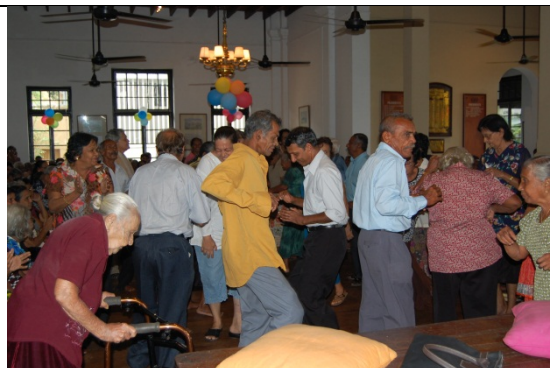
Age, nor infirmity shall prevent them having a good time