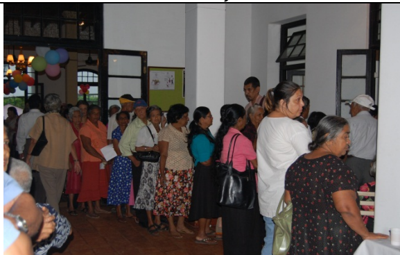
Standing in line for the Bonus and hampers

In order for this Club to increase the number of its welfare beneficiaries and/or increase the amount of the benefit paid to them it is vital that we build up our membership base. As such please persuade your friends and relatives to become members of this prestigious Club by sending in an application form with a year's membership for only $30.00. An application form is included in this newsletter.