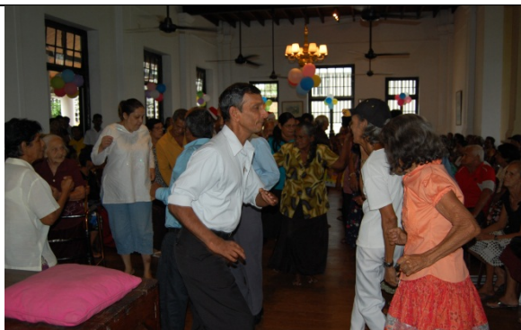
Everyone joins in to show off their bailable skills