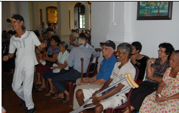
Even if we cannot be on the floor, we can still enjoy it