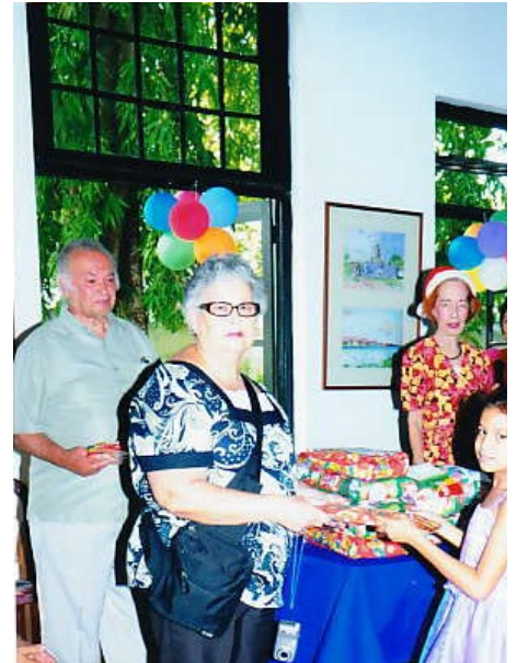
Visitors from Melbourne