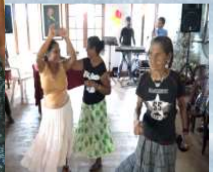
IT'S CHRISTMAS!! DANCE YOUR CARES AWAY