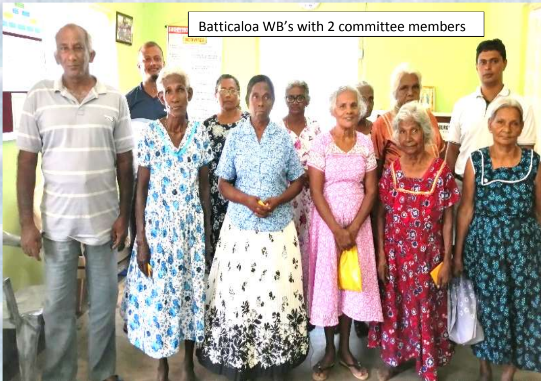
Batticaloa WB's with 2 committee members