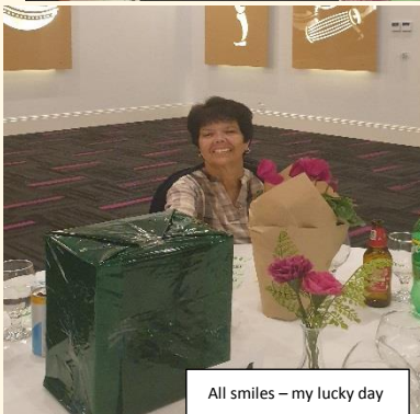
All smiles - my lucky day