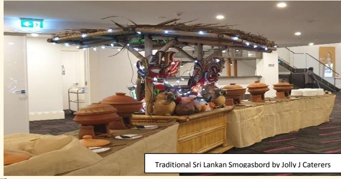
Traditional Sri Lankan Smogasbord by Jolly J Caterers