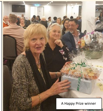
A Happy Prize winner

We appreciate your continued support over the years. Your generosity and donations have helped the Club continue with our financial commitments and provide care for the 'Less Fortunate'. - Editor