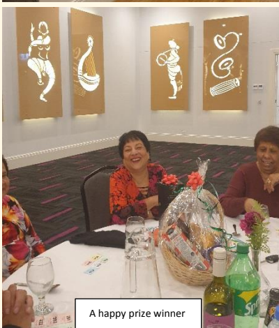
A happy prize winner