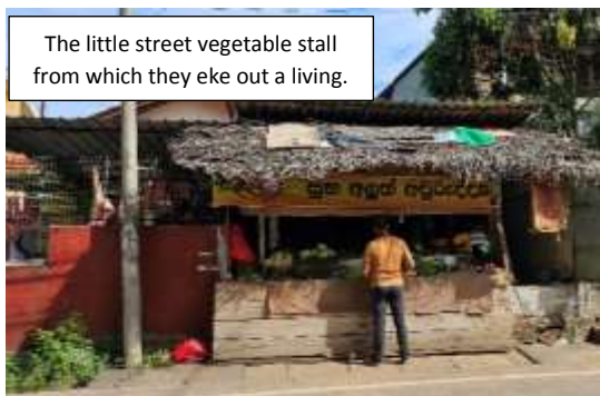
The little street vegetable stall from which they eke out a living.

Your sponsorship funds are remitted in full at the rate of exchange at the time of payment. In addition the Club also provides new or refurbished laptops, smartphones, and other material needs, the student requires. In special circumstances, some families with no financial income are placed on the WB scheme, to help with their daily living. These are provided through our fund-raising efforts.