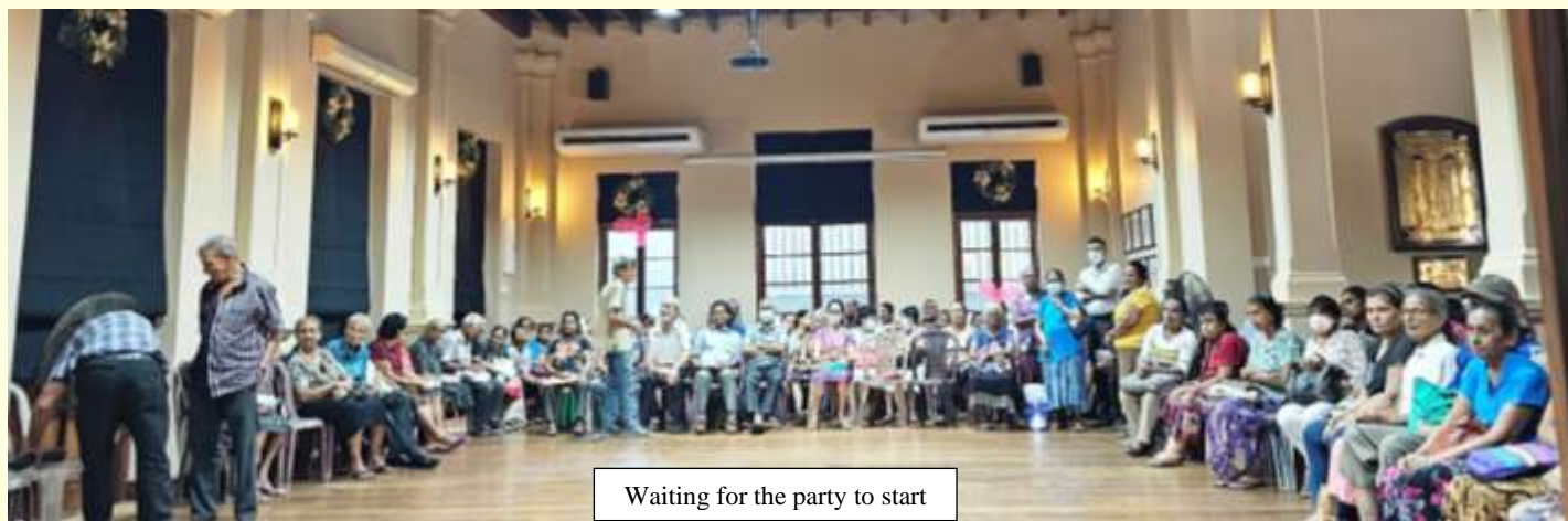
Waiting for the party to start

They Bless you from their hearts and Thank God for people like you who care and help them.