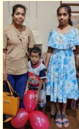
Single mother with an autistic child needing special care. No money for food and basic goods.

As always I look forward to visiting Sri Lanka and meeting up with family and friends. It had been a 4 year gap since my last visit, due to Covid, and putting aside my own little medical issues, I was determined to make the trip. This time I would once again be able to meet with the WB's at the annual Christmas party, hosted by the Club at the DBU, Colombo. This too had not been possible in the last 4 years due to Covid.