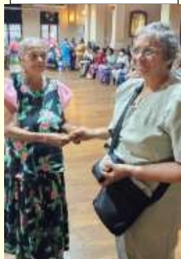
The winner of the 'Baila' competition

The party got under way, with the one man band hired for the occasion, crooning Christmas Carols and very soon the traditional 'Baila' was being belted out. Forgotten were all the aches, pains, and woes of life as the floor was filled with the WB's dancing the 'Baila', all vying to win the first prize!! Time had stood still for them, dressed in their Sunday best with memories of better times and happier days, when they sang, danced and enjoyed life. Those moments of happiness, were brought back to them, once again. A time to savour the food, drinks and dance your cares away. Ironically, it was also sad to see them, seemingly with not a care in the world, dancing away to a popular baila song 'Jolly Karapalla'. For those of you who remember this song, the lyrics are a parody on life itself, "Make merry, die today or die tomorrow, enjoy life".