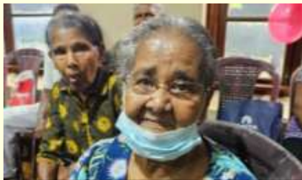
Behind the smile and reflected in the eyes are the hardships of life

As always I look forward to visiting Sri Lanka and meeting up with family and friends. It had been a 4 year gap since my last visit, due to Covid, and putting aside my own little medical issues, I was determined to make the trip. This time I would once again be able to meet with the WB's at the annual Christmas party, hosted by the Club at the DBU, Colombo. This too had not been possible in the last 4 years due to Covid.