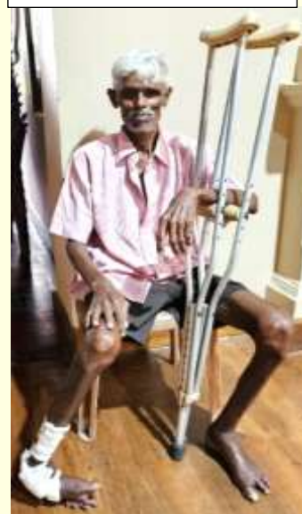
His foot is at a right angle to his ankle. I am at a loss as to how he walks at all.

Speaking to many of them as I could, it was heart-wrenching to listen to their stories. The day to day existence, medical issues, housing problems and for a fact there was many a day, when they would go hungry. This was demonstrated by the fact that the boxes of food they received were promptly put into any bag they carried. Perhaps this would last them longer at home and provide them with 2 meals or perhaps feed others in the family.